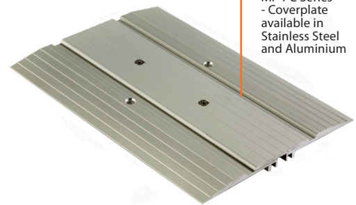
MF-PC Series - Coverplate available in Stainless Steel and Aluminium

Suits polished concrete floors. Can be Surface to surface mounted with tiles, stone, vinyl, concrete and epoxy floors.