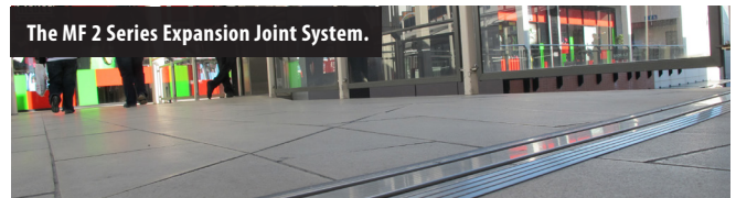
The MF 2 Series Expansion Joint System.