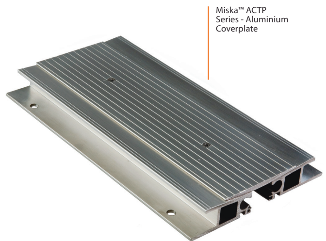
Miska™ ACTP Series - Aluminium Coverplate

sales@miska.com.au AU: 1300 326 539 NZ: 0800 88 22 55