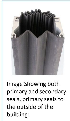
Image Showing both primary and secondary seals, primary seals to the outside of the building.